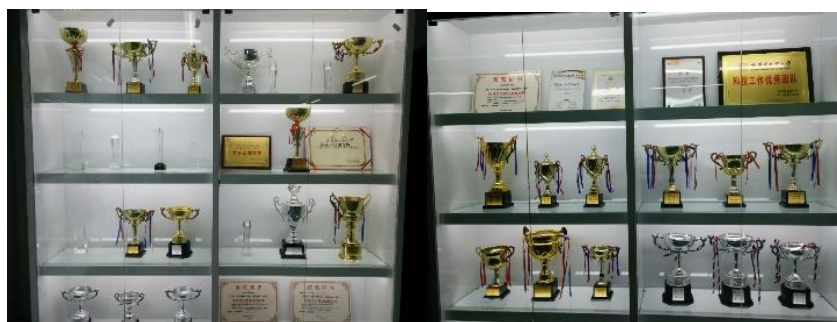
FIG. 2 AWARDS OF INNOVATION AND ENTREPRENEURSHIP COMPETITIONS

In the past three years, our students have published more than 20 papers and obtained more than 10 patents. They have won more than 100 awards for various innovation and entrepreneurship competitions and discipline competitions at the provincial or municipal levels, as shown in Fig. 2. HRT also has participated in international Student Formula in America, Germany and Japan, and won more than 20 awards. In 2016, HRT won the National Championship in FSEC and Baja SAE China, which was the first double Championship in China. In the same year, HRT also won the Innovation Award held by the National Development Bank, Industry and Information Innovation and Entrepreneurship held by the Ministry of Industry and Information and Top 10 Outstanding Technology Innovation Team in Harbin Institute of Technology. In 2017, HRT won many international awards such as the First in Efficiency of SFJ, the First in Lightweight Design and the Third in Design in SFJ. Some graduate from HRT have gone to universities in domestic, Germany and Japan to continue their studies. Others have held important positions in well-known enterprises and institution in China and the employment rate has reached 100%.