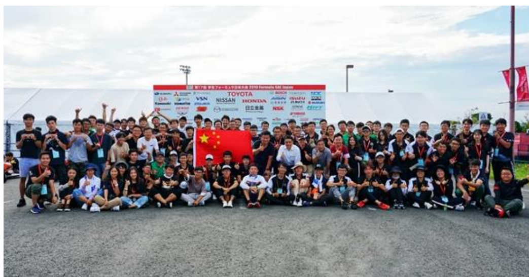
FIG. 1 HIT RACING TEAM

The innovation and entrepreneurship practice base for HRT is highly valued by the school. The base construction is incorporated into the school teaching work system and an expert working group is set up to deploy and manage the construction and the development of the base. In terms of funding, the expert working group set up a special financial department, responsible for the daily financial management and provided sufficient research and operational funding. In addition, the school provides a number of technical and material support. In terms of technology, a number of laboratories and laboratory equipment are open to HRT members and there are professional technical instructors to guide them. In terms of material, the 6,700 square meters of innovation and entrepreneurship space, air-conditioning, 3D printers, electric heaters for carbon fiber products and many other tools do contribute a lot to them.